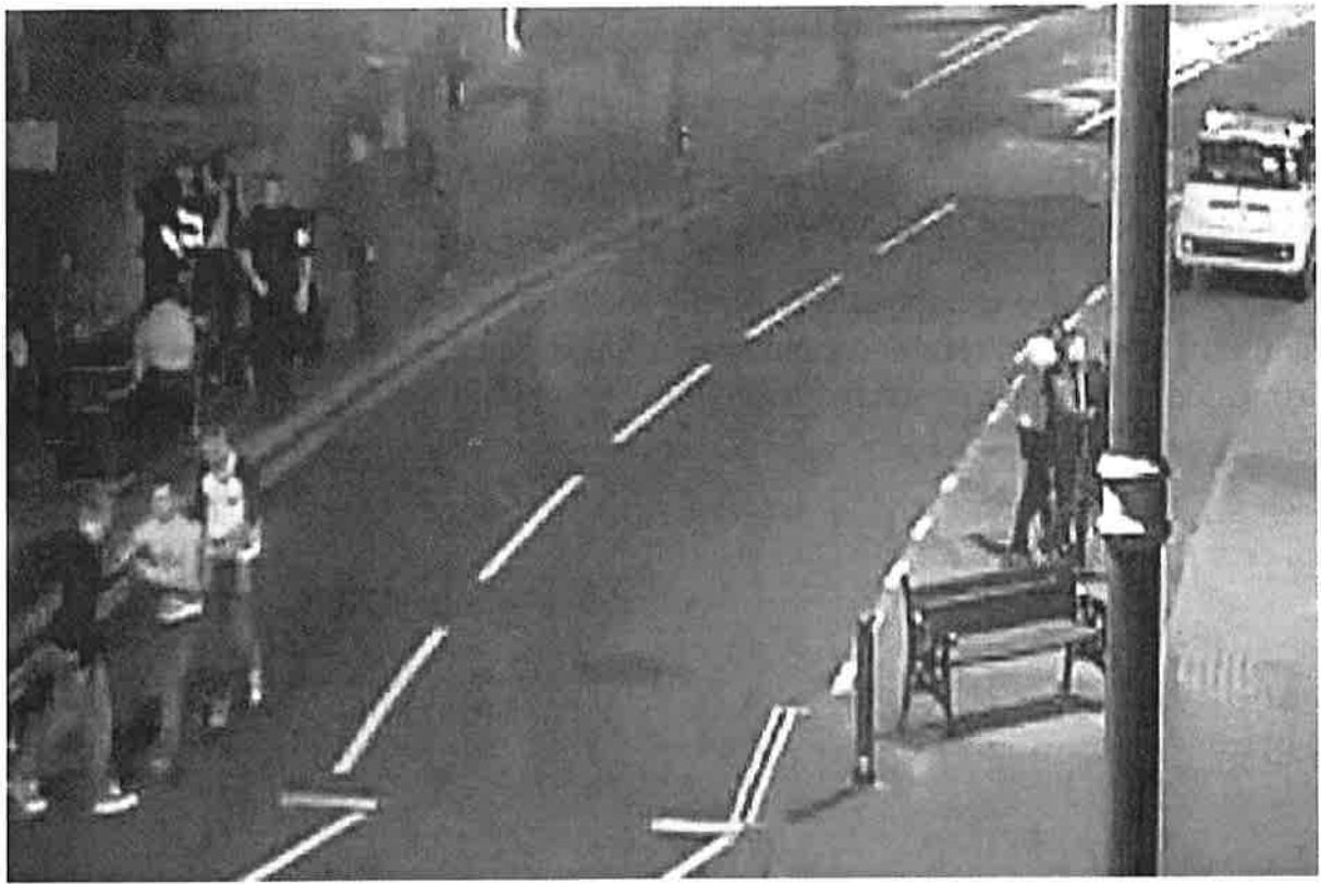
Police have released a CCTV of the fight

Police are appealing for witnesses to the mass fight outside a bar in the seaside resort and have released a CCTV image